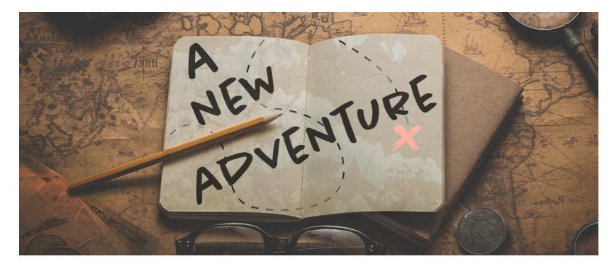
The Adventure of a Lifetime March 12 & 13, 2022