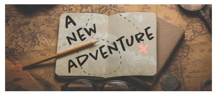
The Adventure of a Lifetime March 12 & 13, 2022